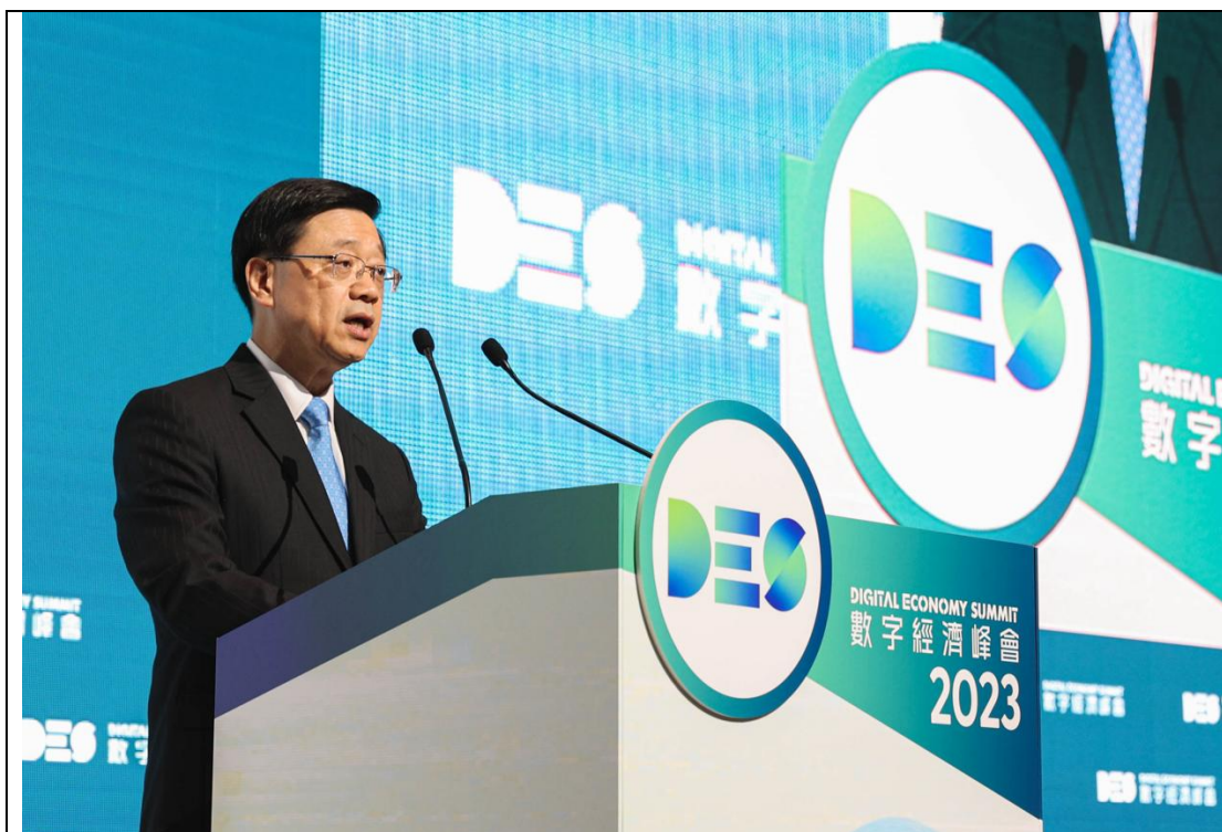
Mr John Lee, Chief Executive of the HKSAR , said to echo the theme of today's Summit, everyone must embrace the sweeping changes brought about by the digital revolution, in order to emerge stronger than ever in a smarter future.