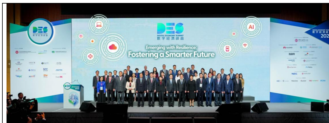
Asia's flagship innovation and technology event Digital Economy Summit 2023, which is jointly organised by the HKSAR Government and Cyberport, kicked off today at the Hong Kong Convention and Exhibition Centre.

For high-resolution photos, please download via this link